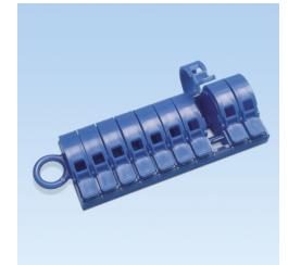
PMD EMPTY DISPENSER